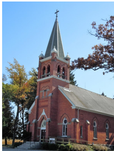
St. Patrick, Irishtown 7631 W. North Gratiot Co. Line Church for Occasional Use

No matter what your present status in the Catholic Church; No matter what your current family or marital situation; No matter what your past or present religious affiliation; No matter what your personal history, age, background, race or color; No matter what your self-image or esteem; You are invited, welcomed, accepted, loved, and respected at St. Vincent de Paul Parish.