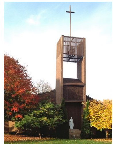
St. Vincent de Paul, Shepherd 168 E. Wright Ave. Parish Church