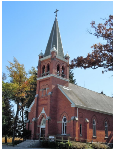
St. Patrick, Irishtown 7631 W. North Gratiot Co. Line Church for Occasional Use

No matter what your present status in the Catholic Church; No matter what your current family or marital situation; No matter what your past or present religious affiliation; No matter what your personal history, age, background, race or color; No matter what your self-image or esteem; You are invited, welcomed, accepted, loved, and respected at St. Vincent de Paul Parish.