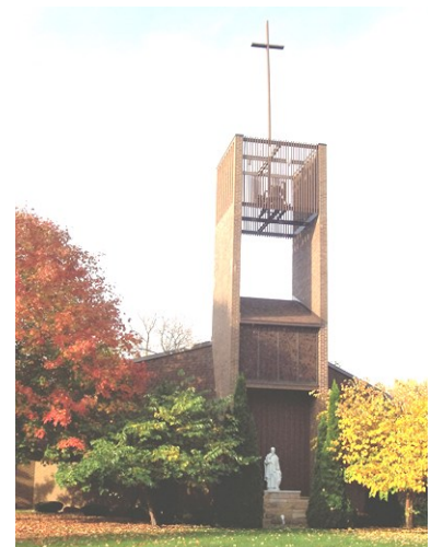
St. Vincent de Paul, Shepherd 168 E. Wright Ave. Parish Church