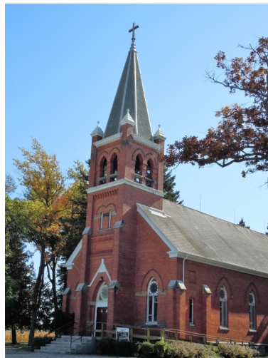
St. Patrick, Irishtown Church of Occasional Use

No matter what your present status in the Catholic Church; No matter what your current family or marital situation; No matter what your past or present religious affiliation; No matter what your personal history, age, background, race or color; No matter what your self-image or esteem; You are invited, welcomed, accepted, loved and respected at St. Vincent de Paul Parish.