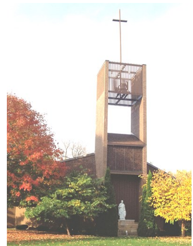
St. Vincent de Paul, Shepherd 168 E. Wright Ave. Parish Church