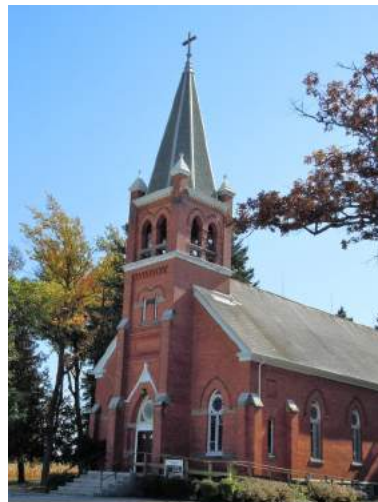
St. Patrick, Irishtown 7631 W. North Gratiot Co. Line Church for Occasional Use

No matter what your present status in the Catholic Church; No matter what your current family or marital situation; No matter what your past or present religious affiliation; No matter what your personal history, age, background, race or color; No matter what your self-image or esteem; You are invited, welcomed, accepted, loved, and respected at St. Vincent de Paul Parish.