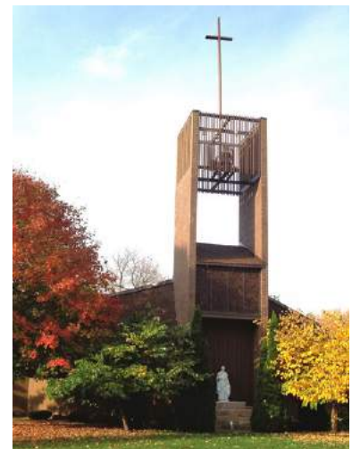
St. Vincent de Paul, Shepherd 168 E. Wright Ave. Parish Church