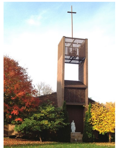
St. Vincent de Paul, Shepherd 168 E. Wright Ave. Parish Church