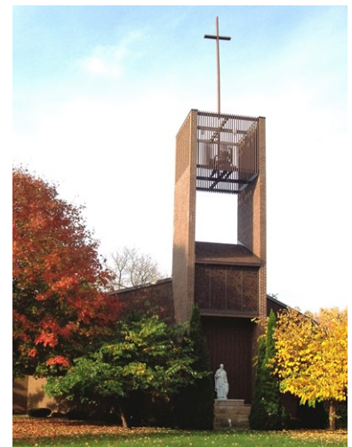
St. Vincent de Paul, Shepherd 168 E. Wright Ave. Parish Church