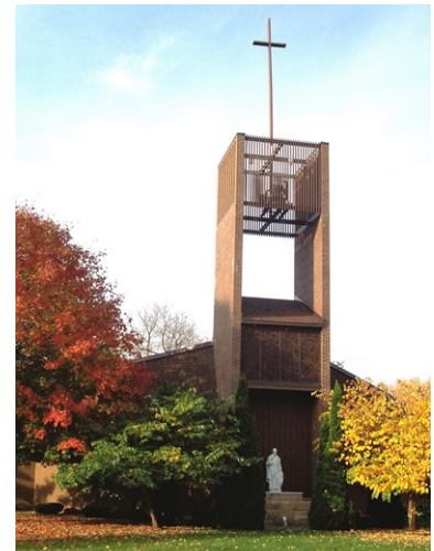
St. Vincent de Paul, Shepherd 168 E. Wright Ave. Parish Church