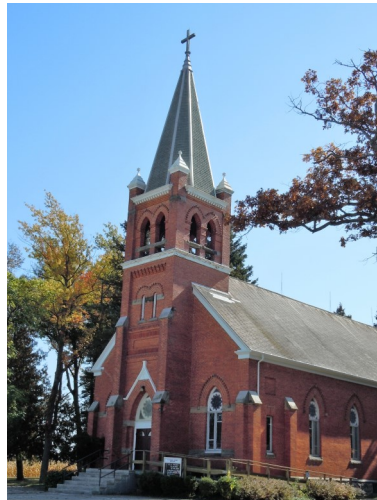
St. Patrick, Irishtown 7631 W. North Gratiot Co. Line Church for Occasional Use

No matter what your present status in the Catholic Church; No matter what your current family or marital situation; No matter what your past or present religious affiliation; No matter what your personal history, age, background, race or color; No matter what your self-image or esteem; You are invited, welcomed, accepted, loved, and respected at St. Vincent de Paul Parish.