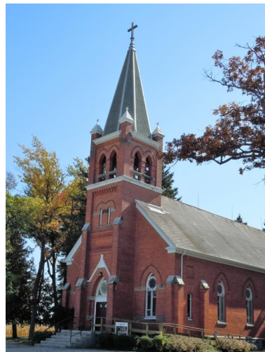
St. Patrick, Irishtown 7631 W. North Gratiot Co. Line Church for Occasional Use

No matter what your present status in the Catholic Church; No matter what your current family or marital situation; No matter what your past or present religious affiliation; No matter what your personal history, age, background, race or color; No matter what your self-image or esteem; You are invited, welcomed, accepted, loved, and respected at St. Vincent de Paul Parish.