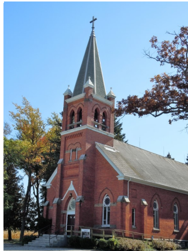
St. Patrick, Irishtown 7631 W. North Gratiot Co. Line

No matter what your present status in the Catholic Church; No matter what your current family or marital situation; No matter what your past or present religious affiliation; No matter what your personal history, age, background, race or color; No matter what your self-image or esteem; You are invited, welcomed, accepted, loved, and respected at St. Vincent de Paul Parish.