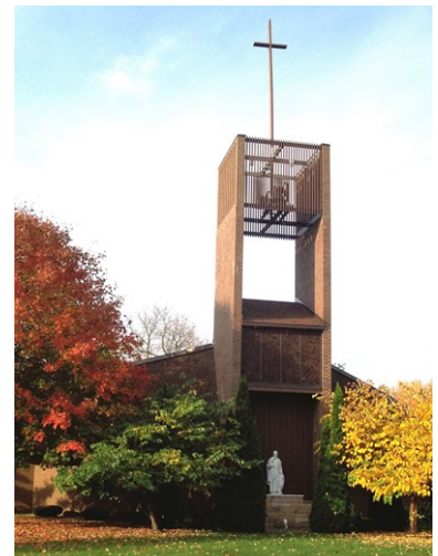
St. Vincent de Paul, Shepherd 168 E. Wright Ave.