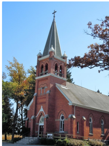
St. Patrick, Irishtown 7631 W. North Gratiot Co. Line

No matter what your present status in the Catholic Church; No matter what your current family or marital situation; No matter what your past or present religious affiliation; No matter what your personal history, age, background, race or color; No matter what your self-image or esteem; You are invited, welcomed, accepted, loved, and respected at St. Vincent de Paul Parish.