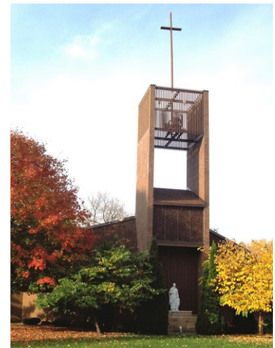
St. Vincent de Paul, Shepherd 168 E. Wright Ave.