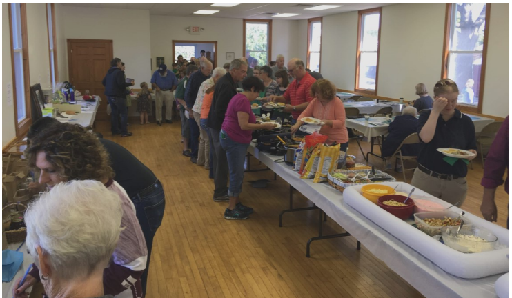
Below are two photos from our September 23 parish picnic. Top: The line extended out the door and in front of the building! Bottom: Some of our favorite chefs; some cooking, some supervising!