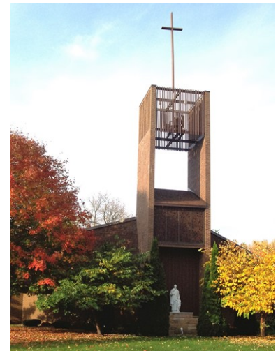
St. Vincent de Paul, Shepherd 168 E. Wright Ave.