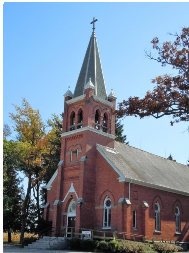
St. Patrick, Irishtown 7631 W. North Gratiot Co. Line

No matter what your present status in the Catholic Church; No matter what your current family or marital situation; No matter what your past or present religious affiliation; No matter what your personal history, age, background, race or color; No matter what your self-image or esteem; You are invited, welcomed, accepted, loved, and respected at St. Vincent de Paul Parish.