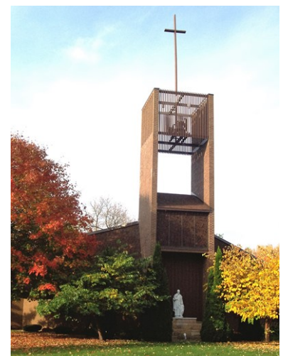
St. Vincent de Paul, Shepherd 168 E. Wright Ave. Parish Church