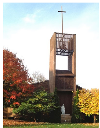
St. Vincent de Paul, Shepherd 168 E. Wright Ave. Parish Church