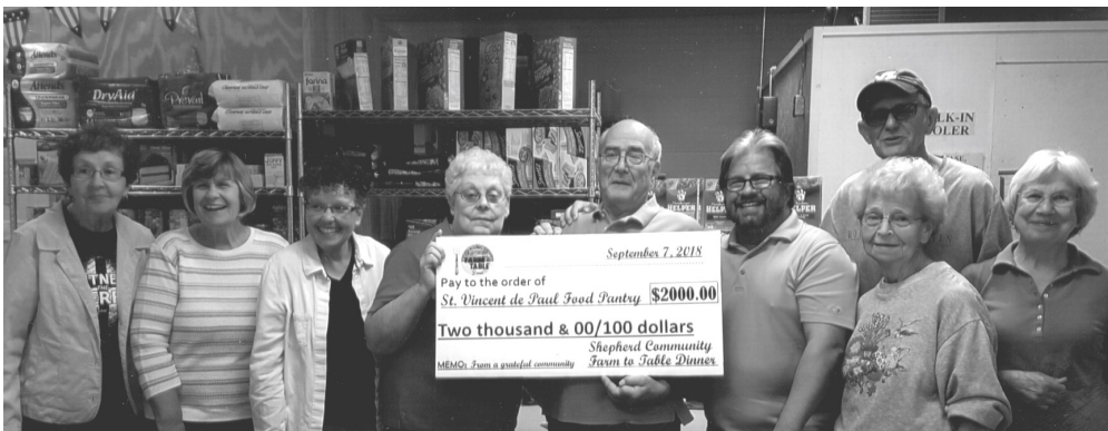
Pictured at left: A great day in our Food Pantry!

Ministry Enrichment Day is part of the Sixth Lay Ministry Assembly, whose theme is "Who Do You Say that I Am?"