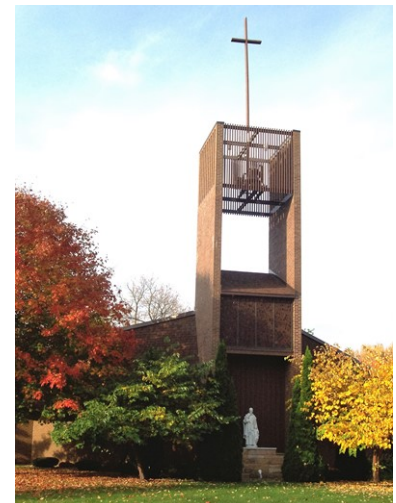
St. Vincent de Paul, Shepherd 168 E. Wright Ave.