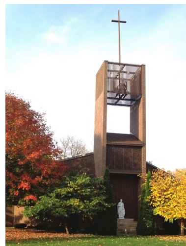
St. Vincent de Paul, Shepherd 168 E. Wright Ave. Parish Church