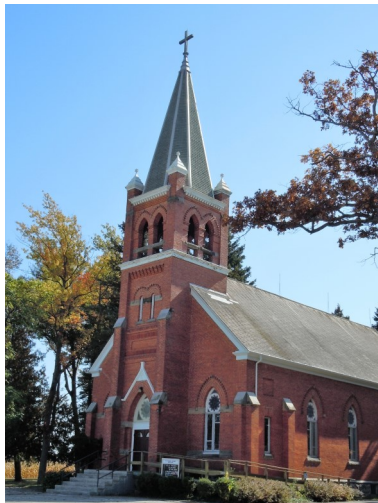
St. Patrick, Irishtown 7631 W. North Gratiot Co. Line Church for Occasional Use

No matter what your present status in the Catholic Church; No matter what your current family or marital situation; No matter what your past or present religious affiliation; No matter what your personal history, age, background, race or color; No matter what your self-image or esteem; You are invited, welcomed, accepted, loved, and respected at St. Vincent de Paul Parish.