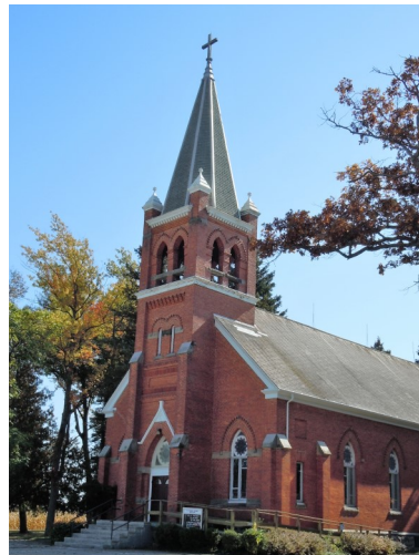
St. Patrick, Irishtown 7631 W. North Gratiot Co. Line Church for Occasional Use

No matter what your present status in the Catholic Church; No matter what your current family or marital situation; No matter what your past or present religious affiliation; No matter what your personal history, age, background, race or color; No matter what your self-image or esteem; You are invited, welcomed, accepted, loved, and respected at St. Vincent de Paul Parish.