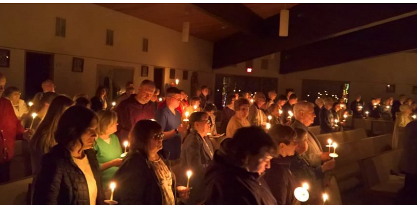
Right: Presentation of the Holy Oils received at the Chrism Mass