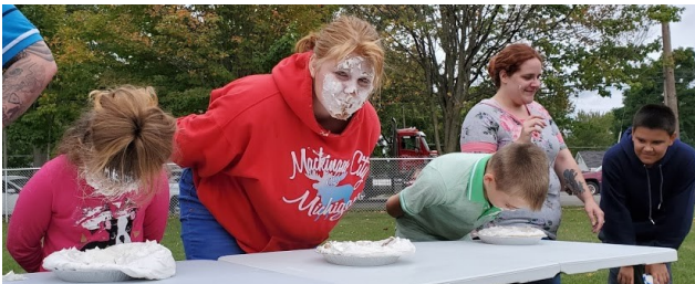
“Whose crazy idea was this and how did I get roped in?”