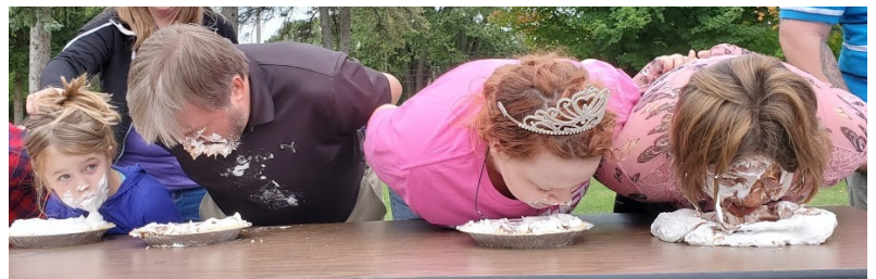
Read her eyes: “I know I’m a mess, mom, but am I in trouble for it?”