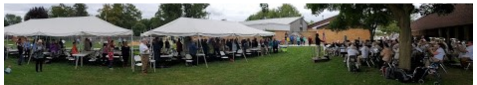
Full plates . . . . . Full house!