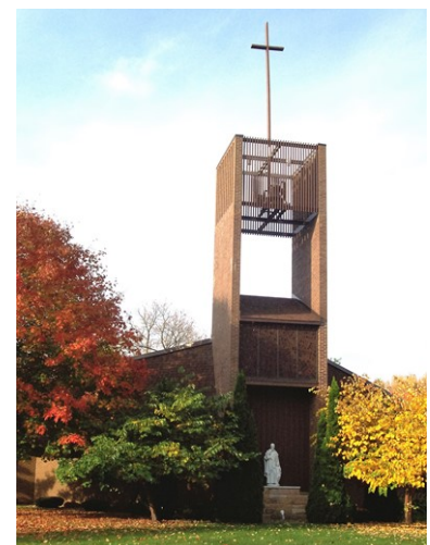
St. Vincent de Paul, Shepherd 168 E. Wright Ave. Parish Church