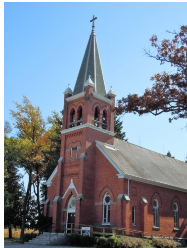
St. Patrick, Irishtown 7631 W. North Gratiot Co. Line Church for Occasional Use

No matter what your present status in the Catholic Church; No matter what your current family or marital situation; No matter what your past or present religious affiliation; No matter what your personal history, age, background, race or color; No matter what your self-image or esteem; You are invited, welcomed, accepted, loved, and respected at St. Vincent de Paul Parish.