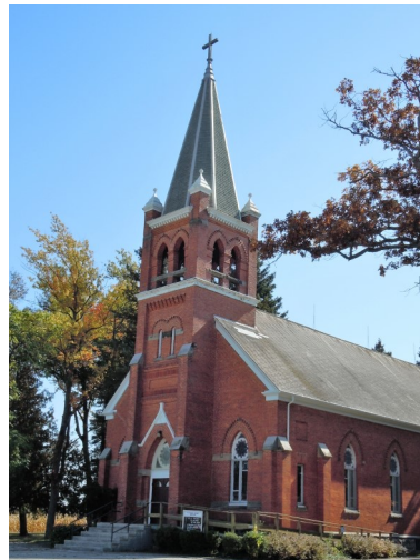
St. Patrick, Irishtown 7631 W. North Gratiot Co. Line Church for Occasional Use

No matter what your present status in the Catholic Church; No matter what your current family or marital situation; No matter what your past or present religious affiliation; No matter what your personal history, age, background, race or color; No matter what your self-image or esteem; You are invited, welcomed, accepted, loved, and respected at St. Vincent de Paul Parish.