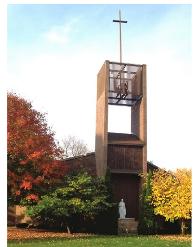
St. Vincent de Paul, Shepherd 168 E. Wright Ave. Parish Church