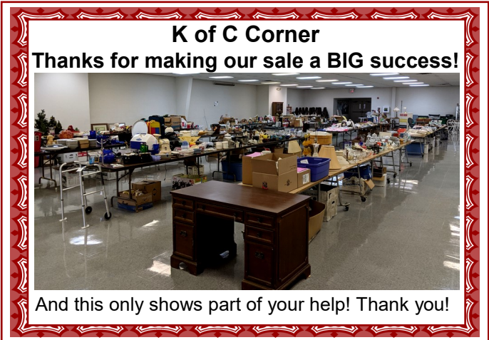
K of C Corner Thanks for making our sale a BIG success!

Fifth Sunday in Ordinary Time Acts 9:26-31 / 1 Jn 3:18-24 / Jn 15:1-8 St Vincent: 10:00am Mass Livestreamed