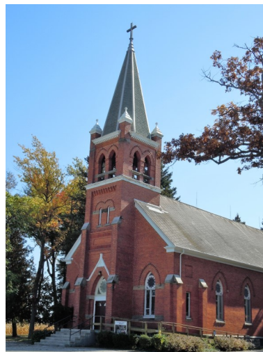
St. Patrick, Irishtown 7631 W. North Gratiot Co. Line Church for Occasional Use

No matter what your present status in the Catholic Church; No matter what your current family or marital situation; No matter what your past or present religious affiliation; No matter what your personal history, age, background, race or color; No matter what your self-image or esteem; You are invited, welcomed, accepted, loved, and respected at St. Vincent de Paul Parish.