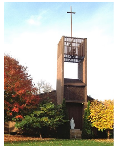
St. Vincent de Paul, Shepherd 168 E. Wright Ave. Parish Church