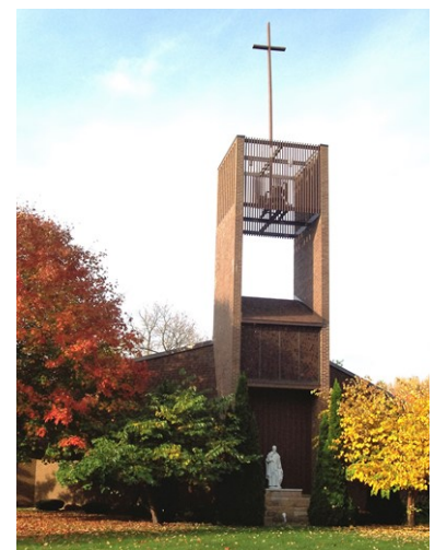
St. Vincent de Paul, Shepherd 168 E. Wright Ave. Parish Church