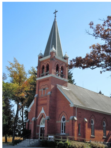
St. Patrick, Irishtown 7631 W. North Gratiot Co. Line Church for Occasional Use

No matter what your present status in the Catholic Church; No matter what your current family or marital situation; No matter what your past or present religious affiliation; No matter what your personal history, age, background, race or color; No matter what your self-image or esteem; You are invited, welcomed, accepted, loved, and respected at St. Vincent de Paul Parish.