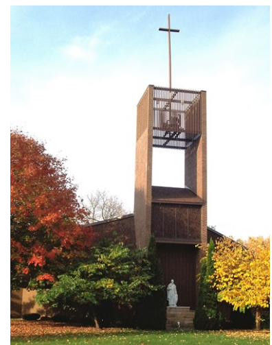
St. Vincent de Paul, Shepherd 168 E. Wright Ave. Parish Church