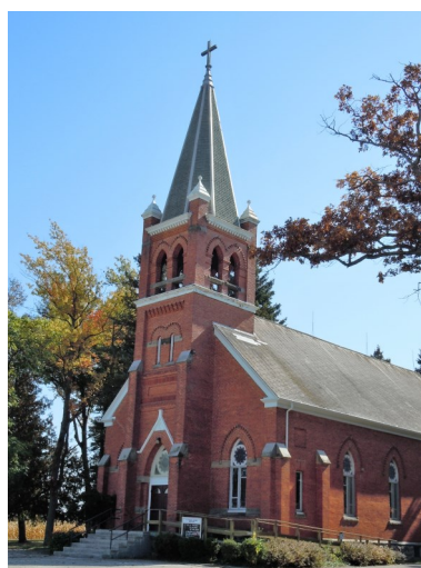
St. Patrick, Irishtown 7631 W. North Gratiot Co. Line Church for Occasional Use

No matter what your present status in the Catholic Church; No matter what your current family or marital situation; No matter what your past or present religious affiliation; No matter what your personal history, age, background, race or color; No matter what your self-image or esteem; You are invited, welcomed, accepted, loved, and respected at St. Vincent de Paul Parish.