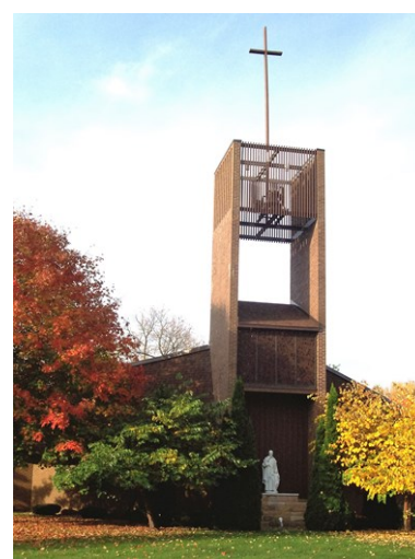
St. Vincent de Paul, Shepherd 168 E. Wright Ave. Parish Church