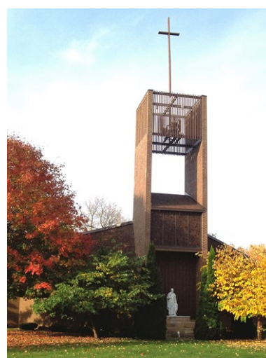
St. Vincent de Paul, Shepherd 168 E. Wright Ave. Parish Church