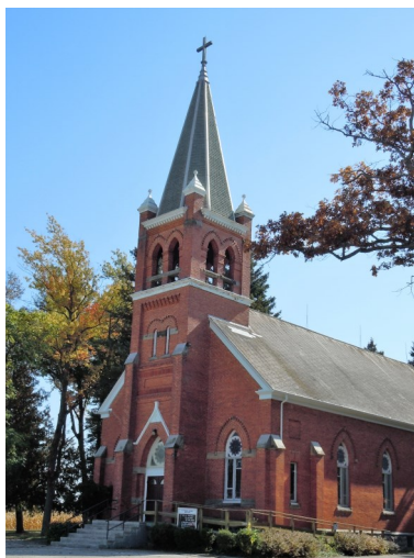
St. Patrick, Irishtown 7631 W. North Gratiot Co. Line Church for Occasional Use

No matter what your present status in the Catholic Church; No matter what your current family or marital situation; No matter what your past or present religious affiliation; No matter what your personal history, age, background, race or color; No matter what your self-image or esteem; You are invited, welcomed, accepted, loved, and respected at St. Vincent de Paul Parish.