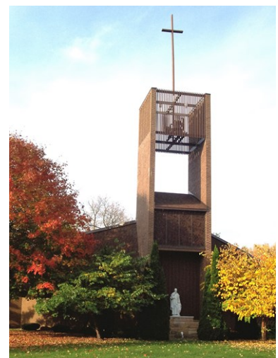
St. Vincent de Paul, Shepherd 168 E. Wright Ave. Parish Church