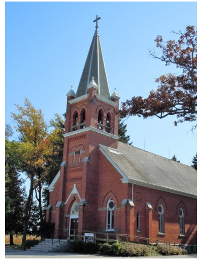
St. Patrick, Irishtown 7631 W. North Gratiot Co. Line Church for Occasional Use

No matter what your present status in the Catholic Church; No matter what your current family or marital situation; No matter what your past or present religious affiliation; No matter what your personal history, age, background, race or color; No matter what your self-image or esteem; You are invited, welcomed, accepted, loved, and respected at St. Vincent de Paul Parish.