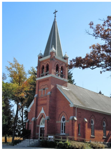
St. Patrick, Irishtown 7631 W. North Gratiot Co. Line Church for Occasional Use

No matter what your present status in the Catholic Church; No matter what your current family or marital situation; No matter what your past or present religious affiliation; No matter what your personal history, age, background, race or color; No matter what your self-image or esteem; You are invited, welcomed, accepted, loved, and respected at St. Vincent de Paul Parish.