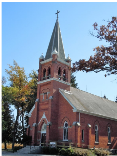
St. Patrick, Irishtown 7631 W. North Gratiot Co. Line Church for Occasional Use

No matter what your present status in the Catholic Church; No matter what your current family or marital situation; No matter what your past or present religious affiliation; No matter what your personal history, age, background, race or color; No matter what your self-image or esteem; You are invited, welcomed, accepted, loved, and respected at St. Vincent de Paul Parish.