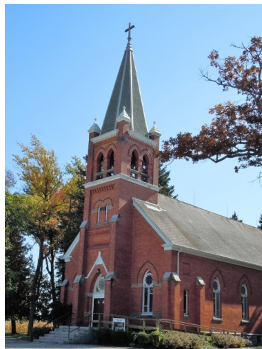
St. Patrick, Irishtown 7631 W. North Gratiot Co. Line Church for Occasional Use

No matter what your present status in the Catholic Church; No matter what your current family or marital situation; No matter what your past or present religious affiliation; No matter what your personal history, age, background, race or color; No matter what your self-image or esteem; You are invited, welcomed, accepted, loved, and respected at St. Vincent de Paul Parish.