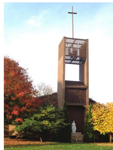
St. Vincent de Paul, Shepherd 168 E. Wright Ave. Parish Church