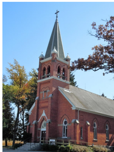
St. Patrick, Irishtown 7631 W. North Gratiot Co. Line Church for Occasional Use

No matter what your present status in the Catholic Church; No matter what your current family or marital situation; No matter what your past or present religious affiliation; No matter what your personal history, age, background, race or color; No matter what your self-image or esteem; You are invited, welcomed, accepted, loved, and respected at St. Vincent de Paul Parish.