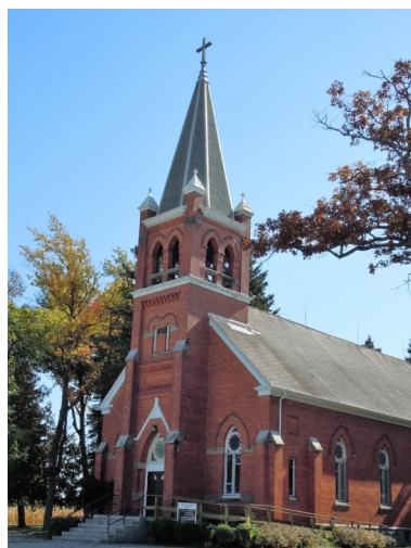
St. Patrick, Irishtown 7631 W. North Gratiot Co. Line Church for Occasional Use

No matter what your present status in the Catholic Church; No matter what your current family or marital situation; No matter what your past or present religious affiliation; No matter what your personal history, age, background, race or color; No matter what your self-image or esteem; You are invited, welcomed, accepted, loved, and respected at St. Vincent de Paul Parish.