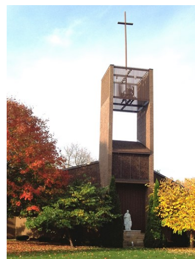
St. Vincent de Paul, Shepherd 168 E. Wright Ave. Parish Church