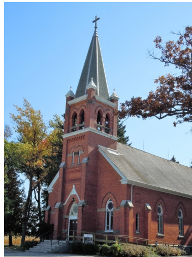
St. Patrick, Irishtown 7631 W. North Gratiot Co. Line Church for Occasional Use

No matter what your present status in the Catholic Church; No matter what your current family or marital situation; No matter what your past or present religious affiliation; No matter what your personal history, age, background, race or color; No matter what your self-image or esteem; You are invited, welcomed, accepted, loved, and respected at St. Vincent de Paul Parish.