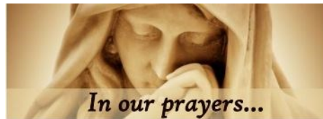
In our prayers...