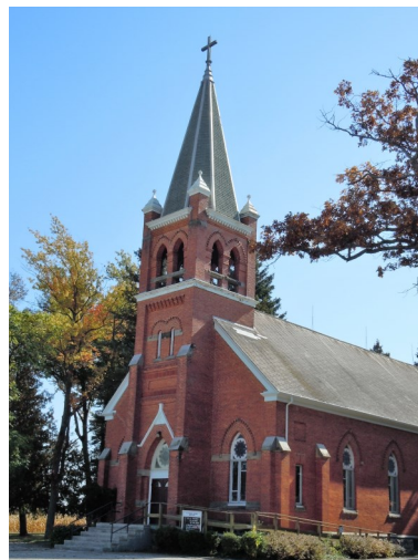
St. Patrick, Irishtown 7631 W. North Gratiot Co. Line

No matter what your present status in the Catholic Church; No matter what your current family or marital situation; No matter what your past or present religious affiliation; No matter what your personal history, age, background, race or color; No matter what your self-image or esteem; You are invited, welcomed, accepted, loved, and respected at St. Vincent de Paul Parish.