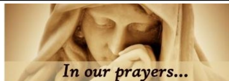
In our prayers...