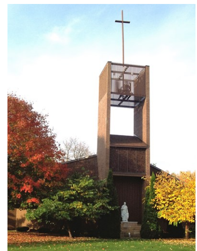
St. Vincent de Paul, Shepherd 168 E. Wright Ave.