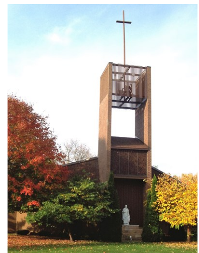
St. Vincent de Paul, Shepherd 168 E. Wright Ave.