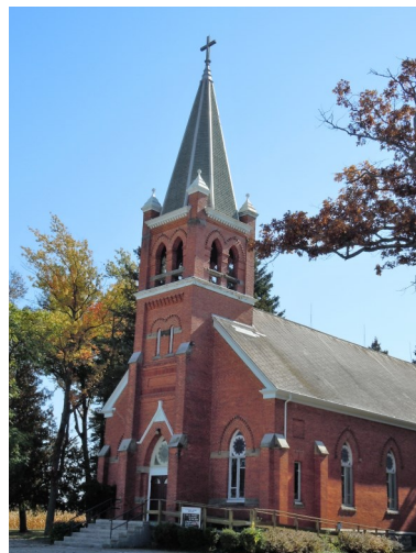
St. Patrick, Irishtown 7631 W. North Gratiot Co. Line

No matter what your present status in the Catholic Church; No matter what your current family or marital situation; No matter what your past or present religious affiliation; No matter what your personal history, age, background, race or color; No matter what your self-image or esteem; You are invited, welcomed, accepted, loved, and respected at St. Vincent de Paul Parish.