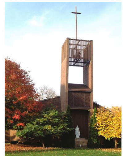
St. Vincent de Paul, Shepherd 168 E. Wright Ave.