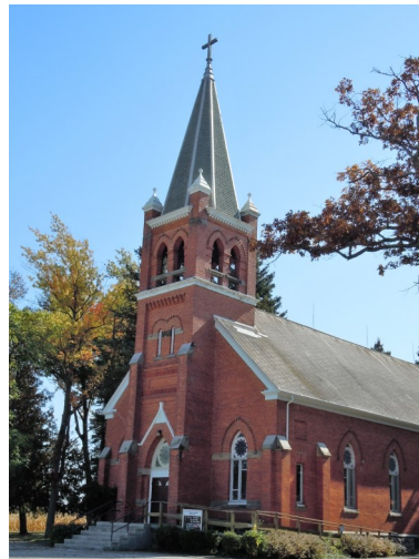
St. Patrick, Irishtown 7631 W. North Gratiot Co. Line

No matter what your present status in the Catholic Church; No matter what your current family or marital situation; No matter what your past or present religious affiliation; No matter what your personal history, age, background, race or color; No matter what your self-image or esteem; You are invited, welcomed, accepted, loved, and respected at St. Vincent de Paul Parish.