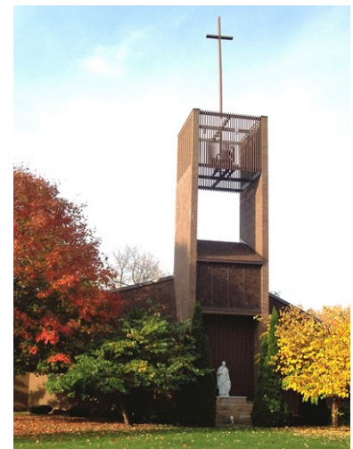
St. Vincent de Paul, Shepherd 168 E. Wright Ave.