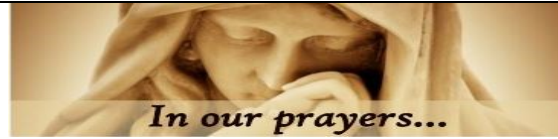
In our prayers...